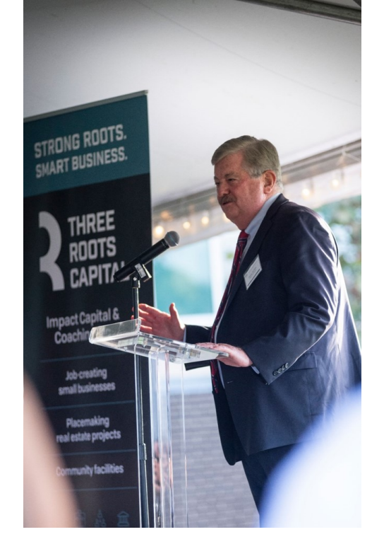
Lieutenant Governor Randy McNally made remarks about the importance of access to capital for businesses in the region and the significant role 3Roots is playing.